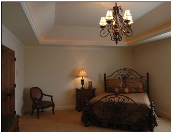
The master suite fit for a King includes a tray ceiling with crown moulding and lighting detail.