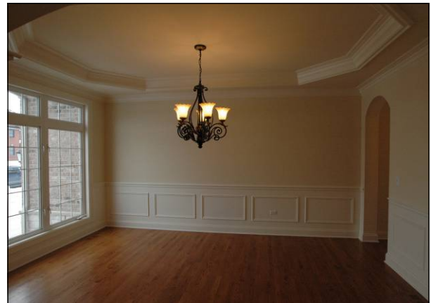
A formal dining room with decorative ceiling, wainscoting and crown moulding to enhance your dining ambiance.