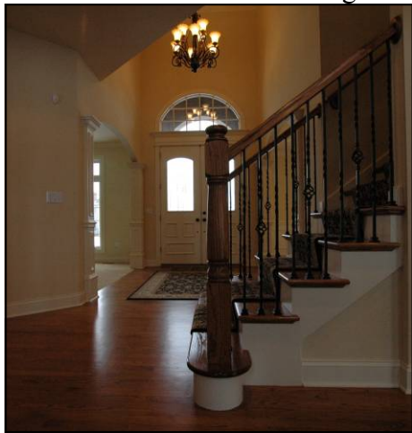
A grand foyer with hardwood flooring and solid oak staircase greets you at the entry.