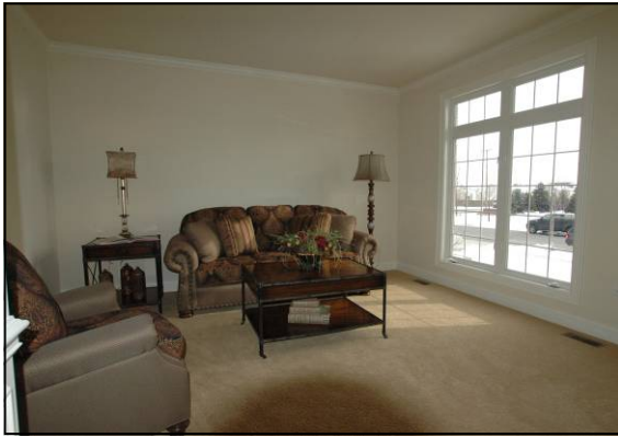
A formal living room area includes crown moulding.