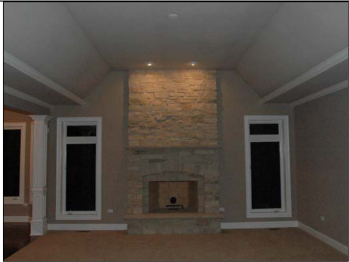
A beautiful floor to ceiling fireplace is the focus of the family room.