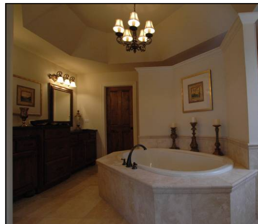
With a master bath fitting of the Queen including double vanities, make-up vanity area, oversized whirlpool tub, volume ceiling and walk in dual shower design.