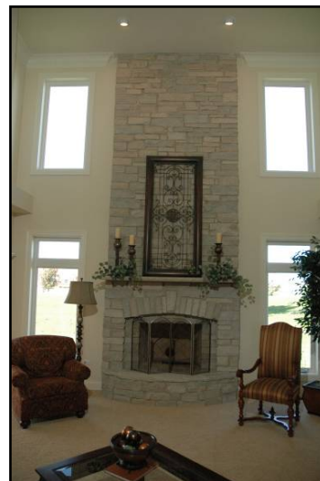
A beautiful two story stone fireplace is the focus of the family room.