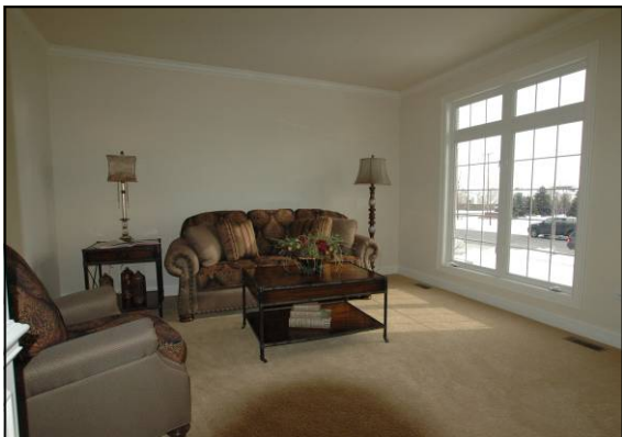
A formal living room area includes crown moulding.