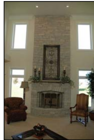
A beautiful two story stone fireplace is the focus of the family room.