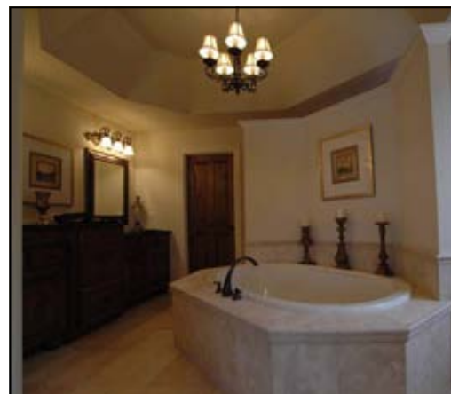
With a master bath fitting of the Queen including double vanities, make-up vanity area, oversized whirlpool tub, volume ceiling and walk in dual shower design.