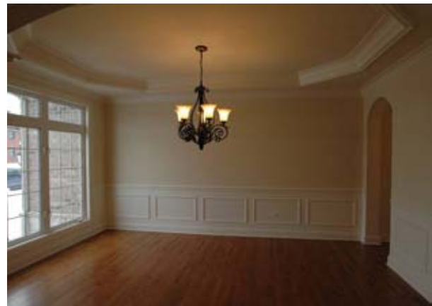
A formal dining room with decorative ceiling, wainscoting and crown moulding to enhance your dining ambiance.