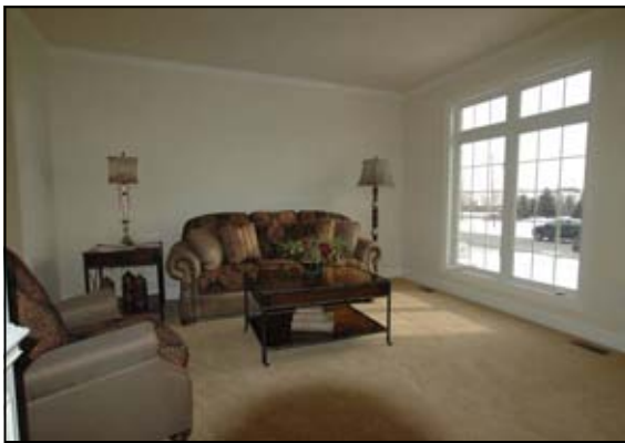
A formal living room area includes crown moulding.